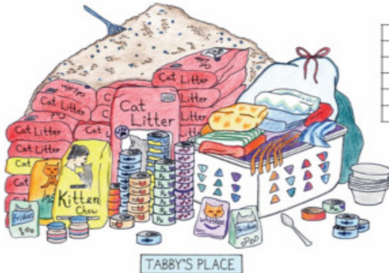
Monthly Usage Chart

Folks are often humble when they drop off a sack of litter or a few bags of toys. “I wish I could bring more,” they say. You should know how deeply we appreciate each donation, from blankets to bleach, canned food to catnip. Check out this to-scale representation comparing our usage of basic necessities with that of an average cat-owning home: